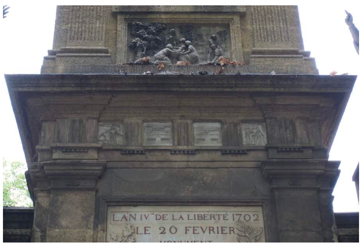
Fig. 2. Monument Joseph Sec, detail of 'assignats', 1792, Aix-en-Provence.